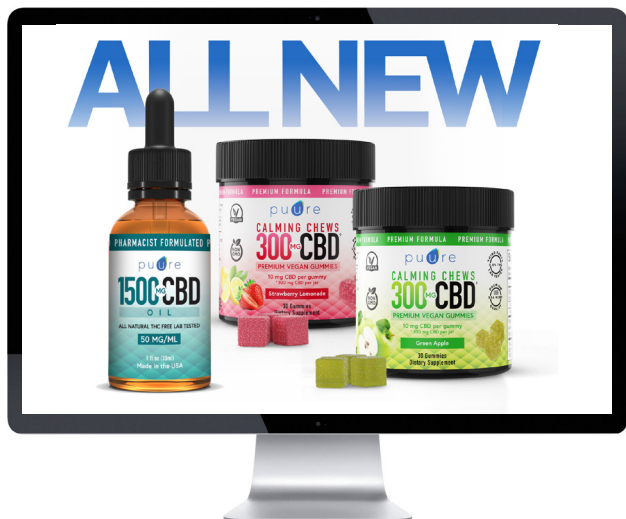
Web Content and Digital Graphics